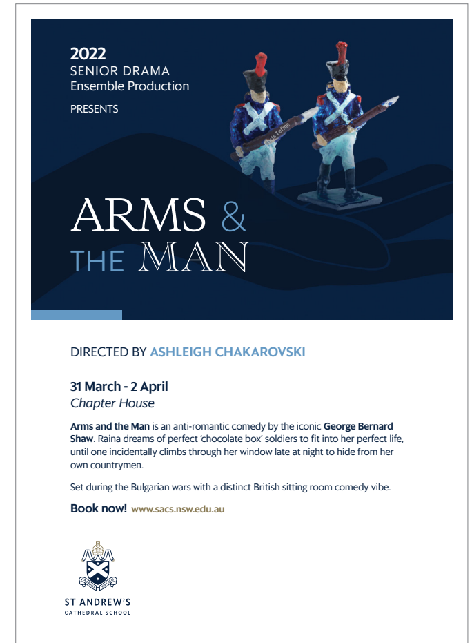
SACS A5 Flyer