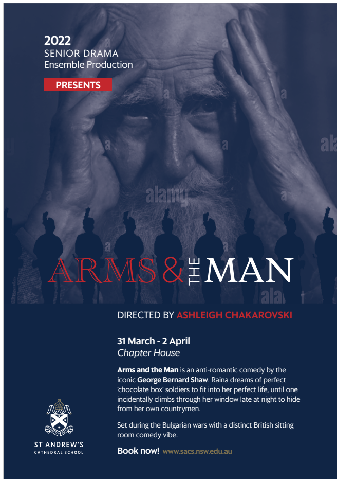
SACS A5 Flyer