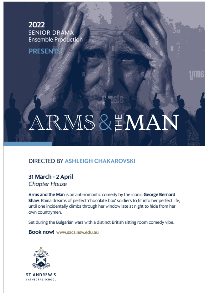
SACS A5 Flyer