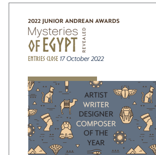
Facebook Post (504 x 504px)