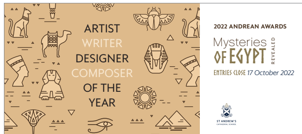
Newsletter Banner (540 x 240px)