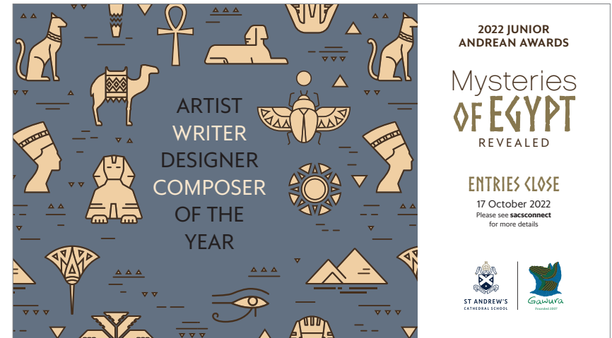
Digital Screen (1920 x 1080px)