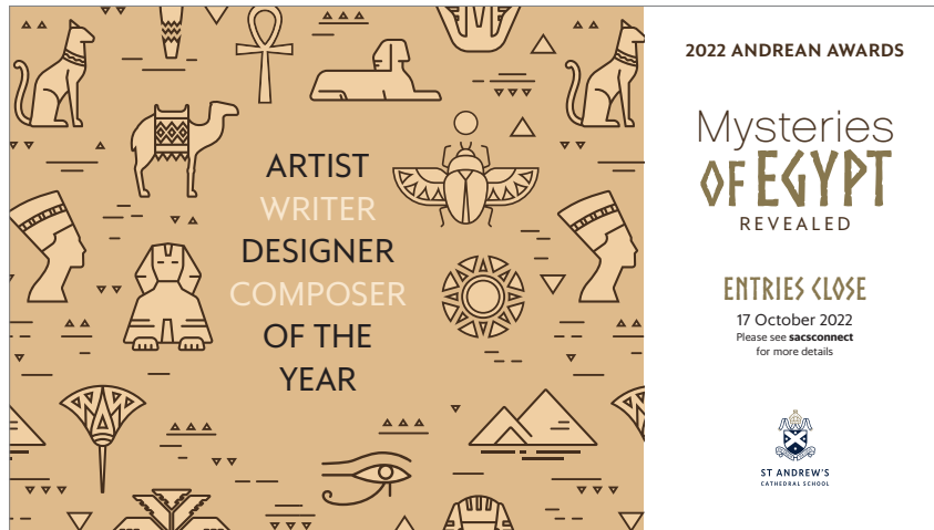
Digital Screen (1920 x 1080px)