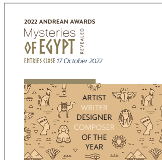
Facebook Post (504 x 504px)